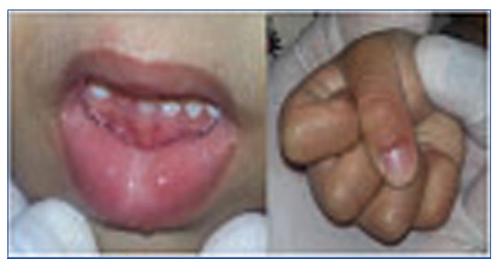
[Table/Fig-5]: Two months follow up showing postoperative healing of lesions.

Fig-4]: Modified conventional mouth guard placed on maxillary arch.